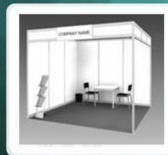
Corporate Sponsor (9-18 SQM)