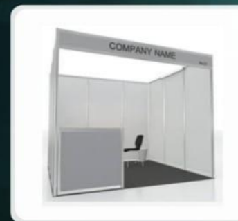
Exhibition Pavilion (9SQM)