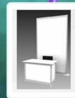
Table Top (2SQM)